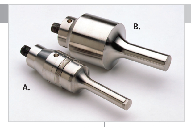
A. <sup>1</sup>/<sub>2</sub>" Horn B. <sup>3</sup>/<sub>4</sub>" Horn